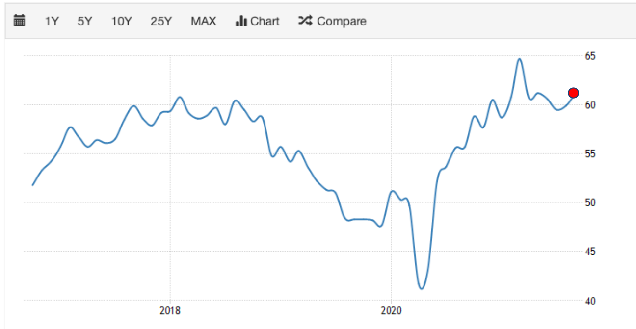
US Purchasing Managers Index (PMI)